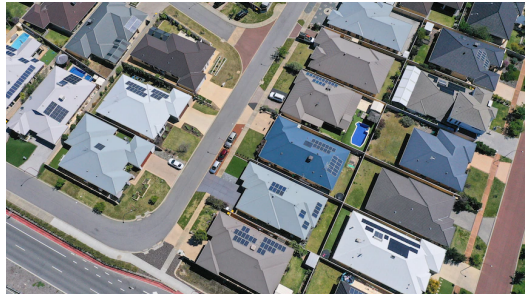
Roughly one in every three Australian homes now has solar panels.