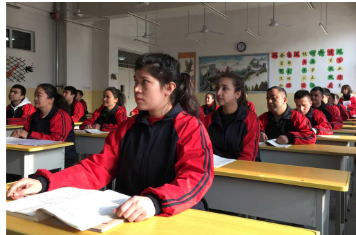
Estimates suggest more than one million Uyghurs have been detained in camps across Xinjiang.

But she says many people in the Uyghur diaspora in Australia and elsewhere in the world know of family members or friends caught up in the industry.