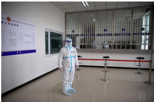
Chinese authorities have established a network of detention centres and education camps across Xinjiang.