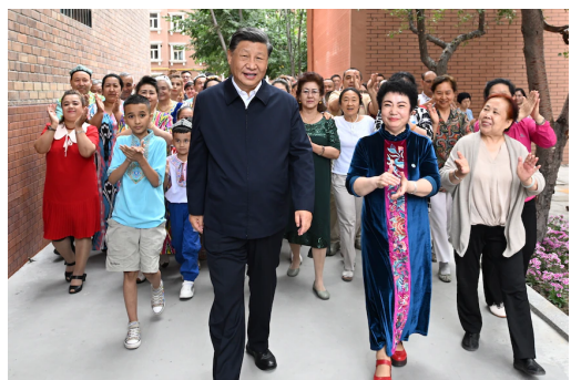
Chinese President Xi Jinping on a visit to Xinjiang last year.

Despite insistences by Beijing that its policies in Xinjiang are aimed at countering terrorism and alleviating poverty, many remain unconvinced.