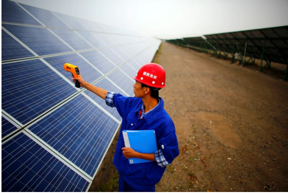
China has come from nowhere to become the world's dominant producer of solar panels.

"There is space for the diversification of supply chains but the key is you've got to do it in the right way.