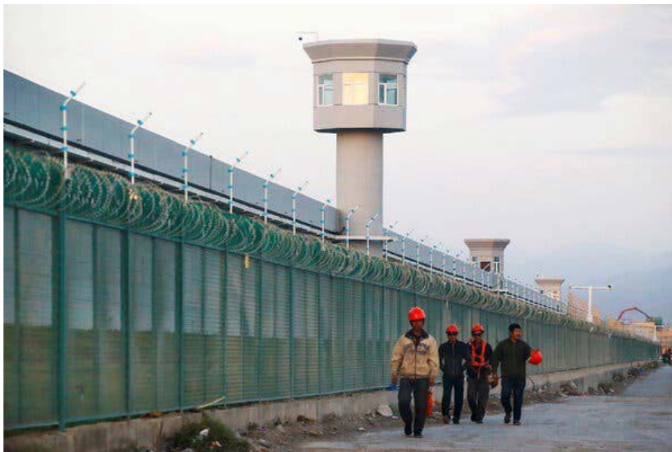
An internment camp in Xinjiang that local officials have portrayed as a vocational training center.

The Xinjiang government has promoted the labor transfer programs in parallel with the re-education camps, efforts that have ramped up drastically under the current leader, Xi Jinping. The government has uprooted many from farms to work in factories and cities, in the belief that steady, supervised work can pull minorities out of poverty and break down cultural barriers. Workers may have little choice but to obey local officials who oversee their move to distant towns and industrial zones to fulfill government-set quotas.