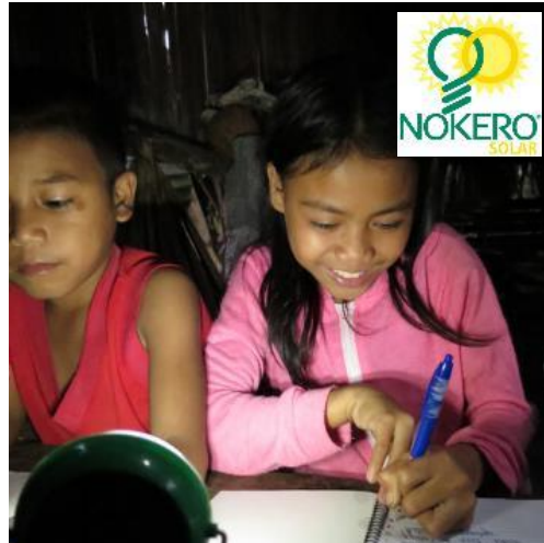
Nokero Solar Lanterns

42 kw rural solar minigrid Kan Byin, Myanmar